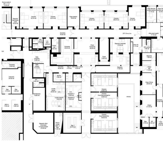
INTENSIVE CARE - CLIENT'S PROPOSAL

ANALYSIS OF THE ARCHITECTURAL SOLUTIONS IDENTIFIED FOR THE ENLARGEMENT OF THE REGIONAL HOSPITAL OF BELLINZONA AND VALLEYS INTENSIVE CARE AND THE OPERATING UNIT IN THE REGIONAL HOSPITAL OF BELLINZONA AND VALLEYS