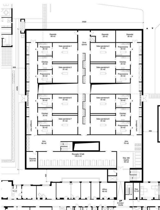
OPERATING UNIT - CLIENT'S PROPOSAL