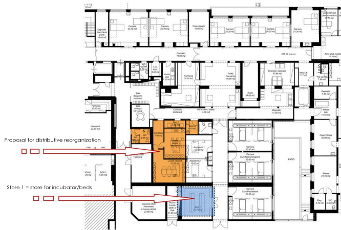
INTENSIVE CARE - PROPOSED CHANGE