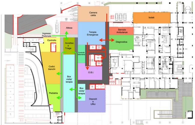
EMERGENCY DEPARTMENT - PROPOSED CHANGE