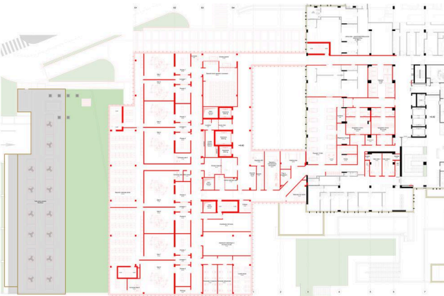
OPERATING UNIT - CLIENT'S PROPOSAL