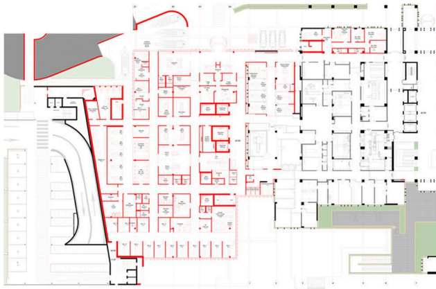
EMERGENCY DEPARTMENT - CLIENT'S PROPOSAL