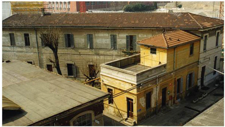
BUILDING INSIDE THE PROPERTY (MILAN)