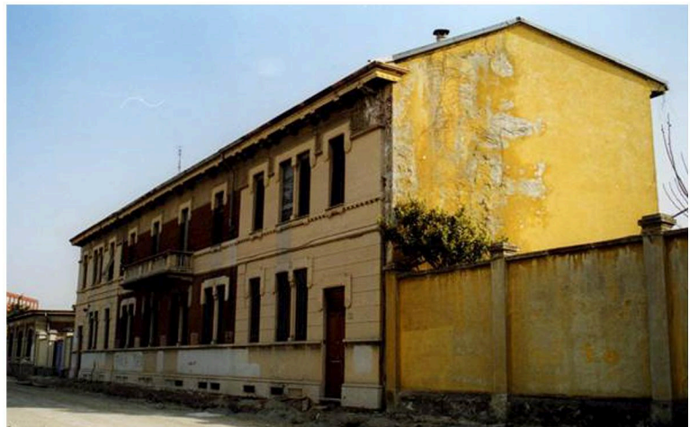
BUILDING INSIDE THE PROPERTY (MILAN)