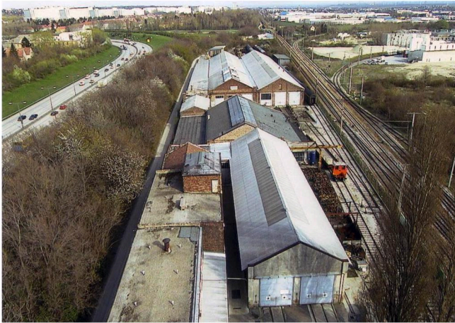
BUILDINGS INSIDE THE PROPERTY (VIENNA)

SERVICES PROVIDED: TECHNICAL EVALUATION, SUPPORT FOR THE ACQUISITION