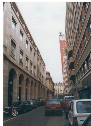
TURIN: BUILDING TO BE COMPLETED