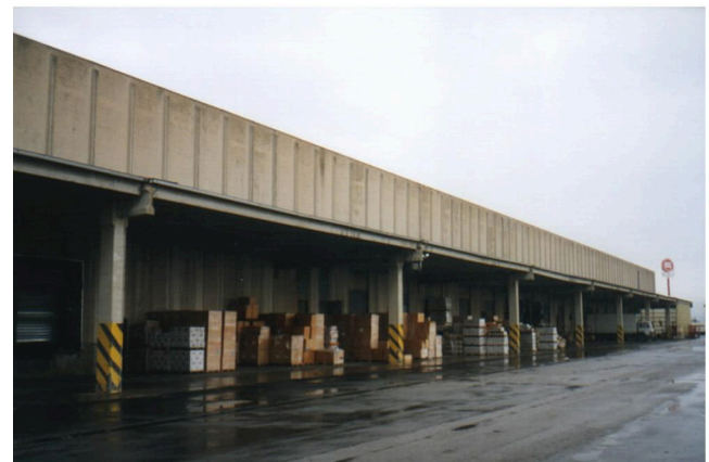
FIANO ROMANO: WAREHOUSE