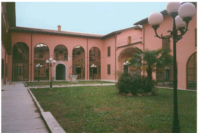
PADENGHE SUL GARDA: FINISHED BUILDING