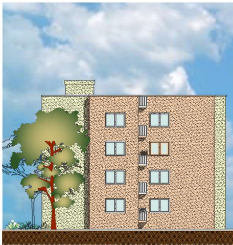
LATERAL FACADE 1