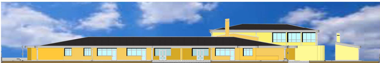
MAIN FACADE (ENTRANCE)