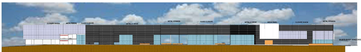
OVERALL MAIN FACADE