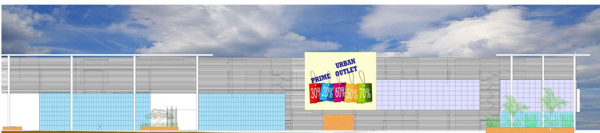
DETAIL OF MAIN FACADE