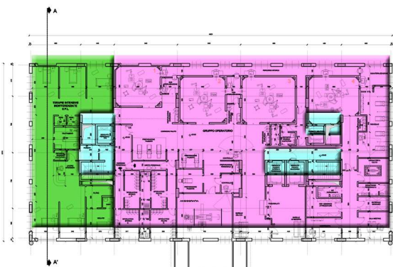
FIFTH FLOOR PLAN