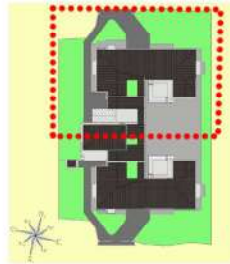
GENERAL PLAN WITH ENLARGEMENT AREA