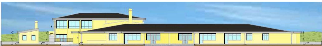
MAIN FACADE (ENTRANCE)