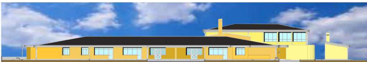
MAIN FACADE (ENTRANCE)